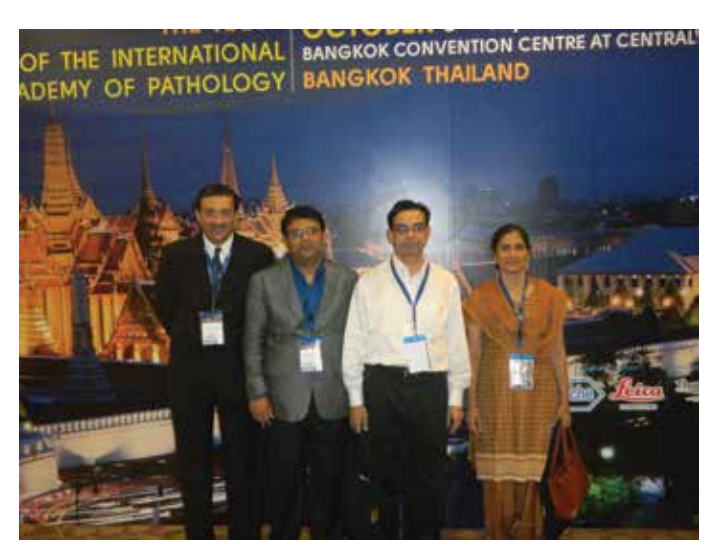
Some of the attendees at the IAP Congress 2014, Bangkok