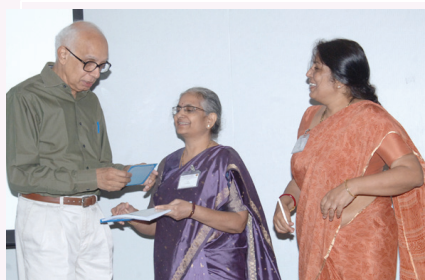
The Inauguration of the CME