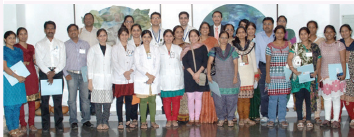
Faculty and some of the participants at the CME