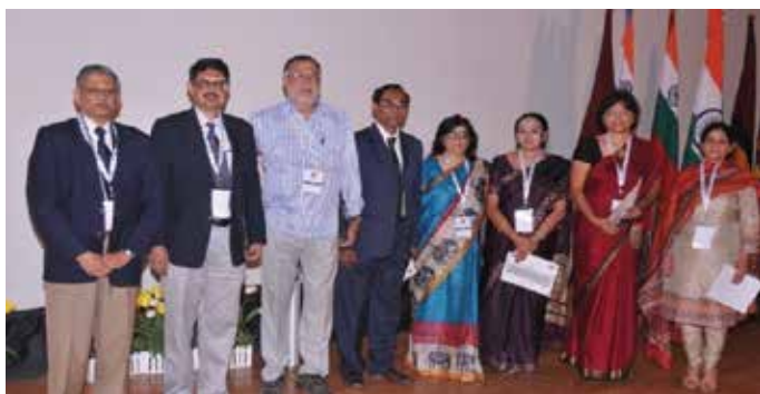
Panelists for the Symposium