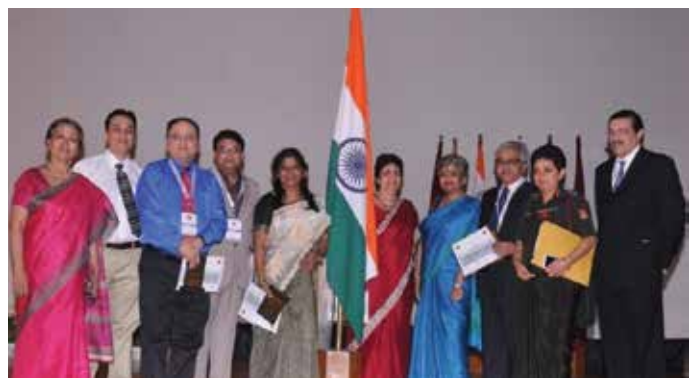
Panelists for the Slide Seminar