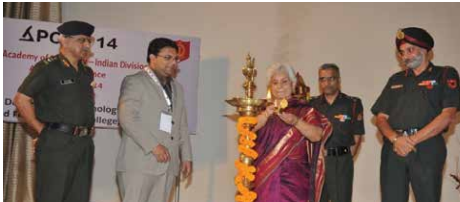
Inauguration of the IAP-ID Annual Conference