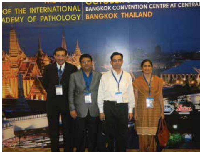
Some of the attendees at the IAP Congress 2014, Bangkok